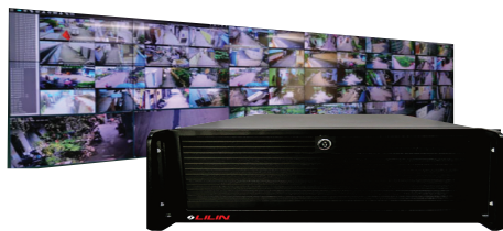
TV Wall Solution