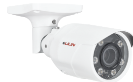
7 Series Smart Camera