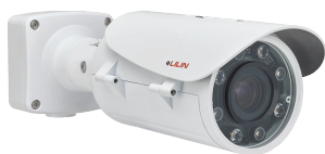
5MP IR Bullet Camera

When You're In The Market For A High Quality Security System, LILIN Should Be The First Thought That Comes To Mind. Our Affordability And High Quality Products Beat Out The Competition Every Time!